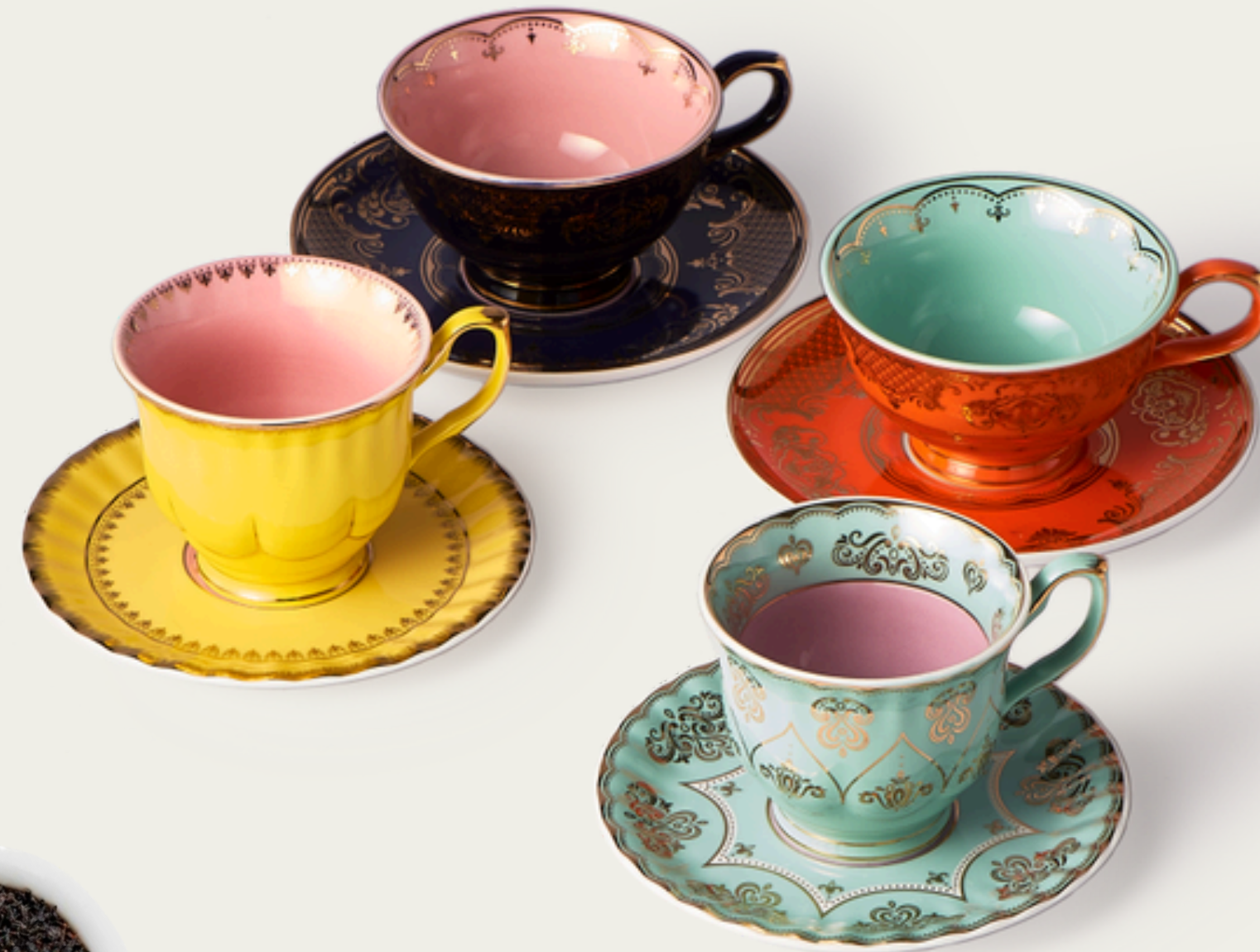
polspotten tea set