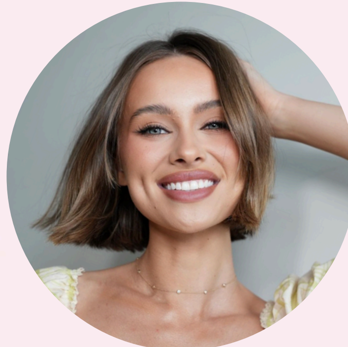
HAILEY POLK FASHION INFLUENCER 235K Followers