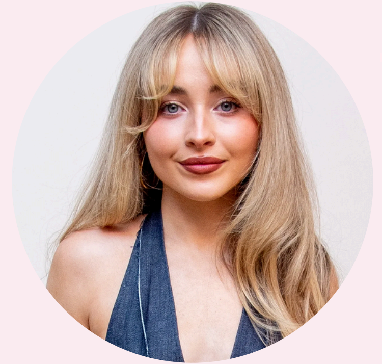
SABRINA CARPENTER SINGER 13.8M Followers