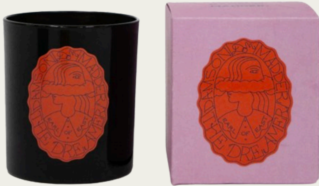
earl of east x DM candle