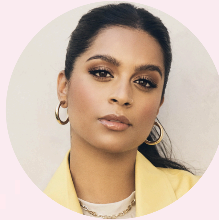
LILY SINGH COMEDIAN 13.8M Followers