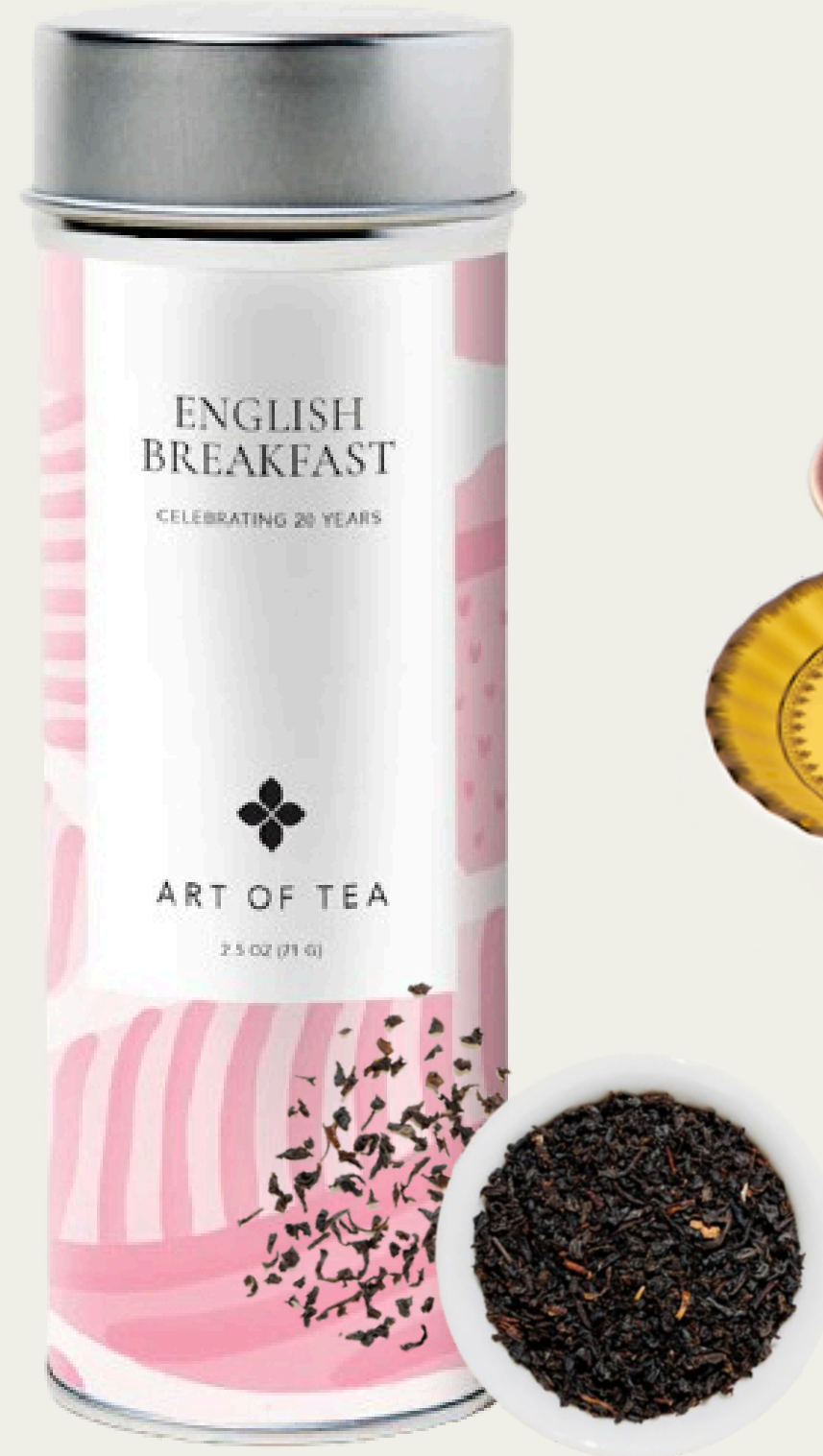
english breakfast tea