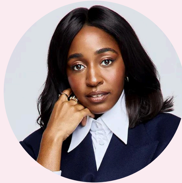
AYO EDEBIRI ACTOR 1M Followers