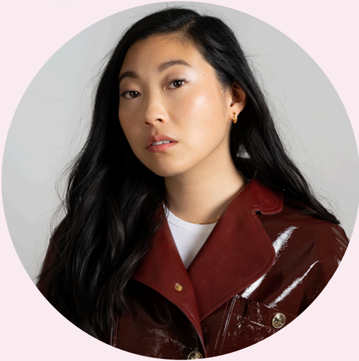
AWKWAFINA ACTOR 2.2M Followers