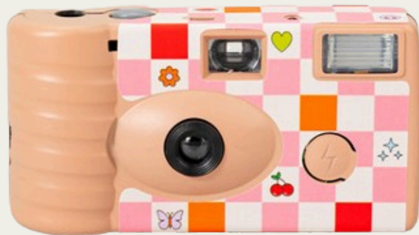
fetti disposable camera