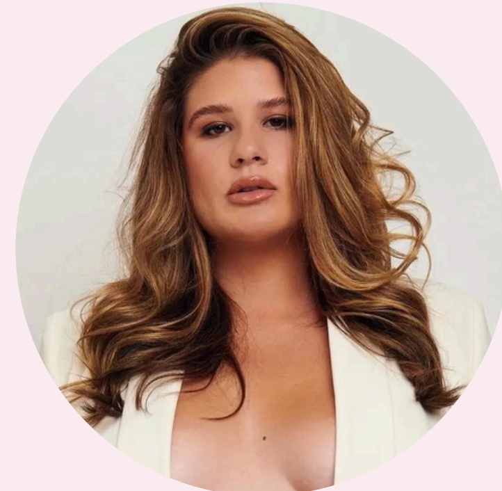
REMI BADER INFLUENCER 715K Followers